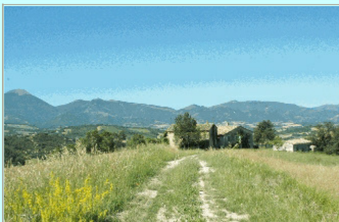
position in the landscape