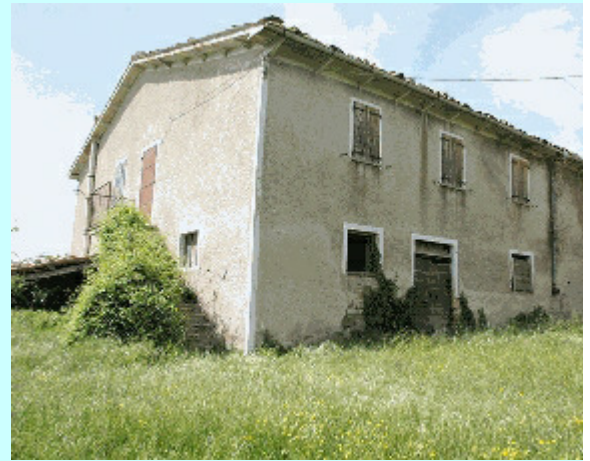
seen from East