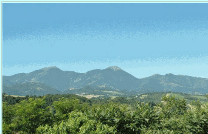
The Catria mountains (1.700 m)