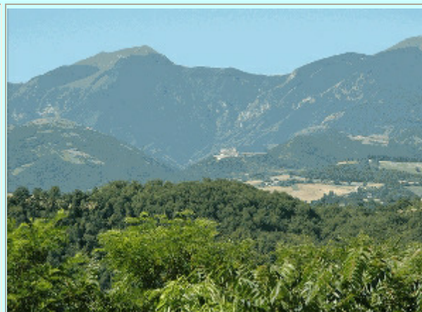
in the center: the famous castle of Frontone