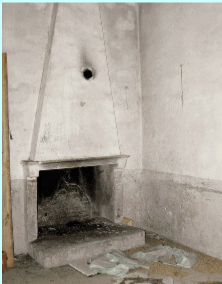
a number of fireplaces in the big house