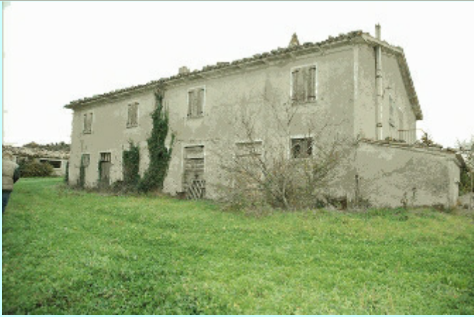
the big house seen from West (stone under the plaster)