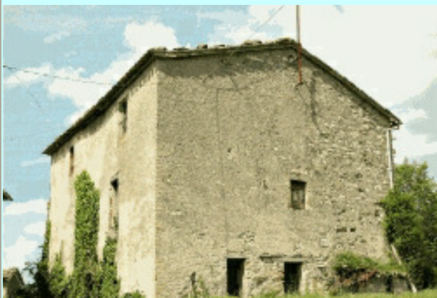
the smaller house (appr. 160 sqm)