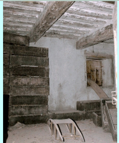
inside the smaller house here the roof is still with wooden beams